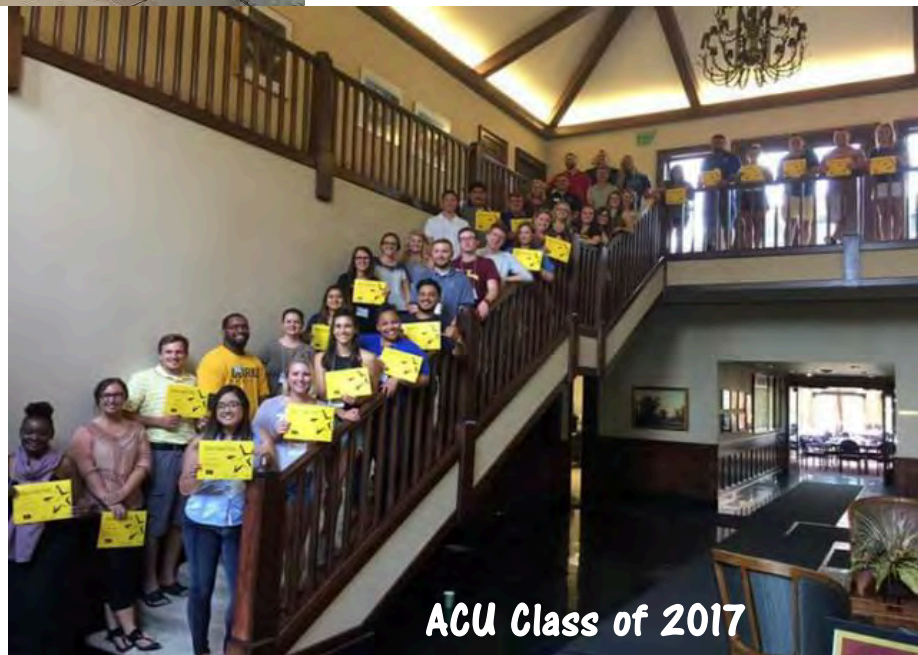
ACU Class of 2017

Watch for more on these two successful summer programs in our next communication!